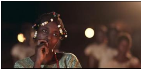
Plate 1: A medium closeup shot of Kitan's reaction about Gbotija's revolt on the poor dinner that was served to the warriors. The glowing dull spot lights created a brownish background that aided in setting the mood in which Kitan is.

The film's use of warm and cool lighting further enhances its semiotic richness. Warm lighting, with its yellow and orange hues, is often employed in scenes of camaraderie, love, and nostalgia, creating a sense of warmth and comfort. In contrast, cool lighting, with its blue and green tones, is used in scenes of tension, conflict, or sorrow. This dichotomy not only sets the emotional tone for the audience but also acts as a visual cue for the underlying emotional states of the characters. For example, The picture below is a snap shot from a scene where the Kitan revolted and queried why they be given a small meal to shared by two persons.